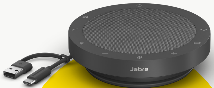
MS TEAMS & UC VARIANTS

We consider sustainability carefully at every stage of product development. The casing of Speak2 55 is made with over 50% sustainable materials**, and has a number of built-in parts that can be repaired or replaced. Better sustainability = longer speaker life = great calls for you and your team for years to come.